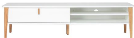
Entertainment unit w 90 d 90 h 42