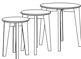
Nest of 3 tables w 50 d 50 h 50