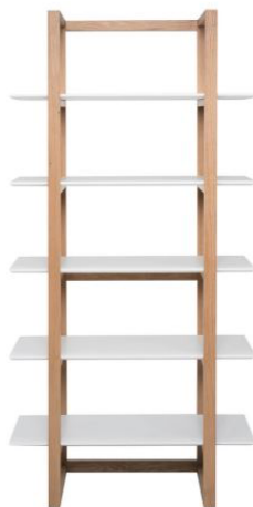
Bookcases w 50 d 50 h 50

*Note: measurements are in centimetres and are approximate only. While we aim to ensure that the information on this tearsheet is correct at the time of printing, it is sometimes necessary for changes to be made to product specifications. To avoid disappointment, we suggest that you obtain confirmation of product specifications and availability with your freedom salesperson before placing your order. Please refer to website for care instructions: www.freedom.com.au or www.freedomfurniture.co.nz